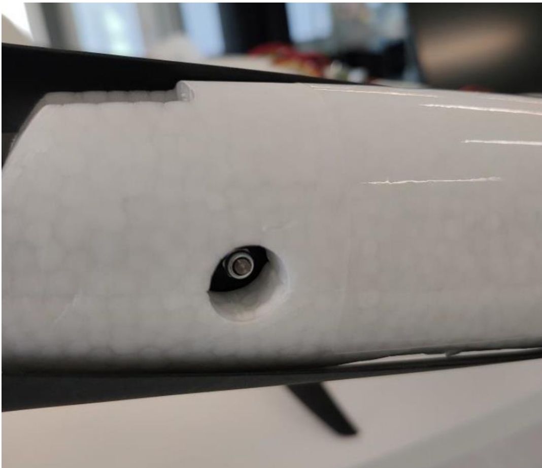
Figure 1 – Self locking nut of tilt mechanism